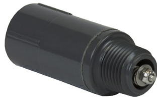
Mipt x Fipt