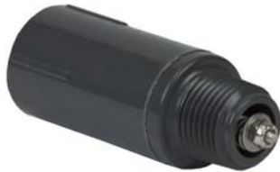
Mipt x Fipt