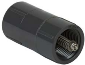
Fipt x Fipt