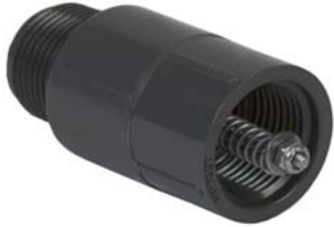
Fipt x Mipt