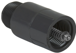
Fipt x Mipt