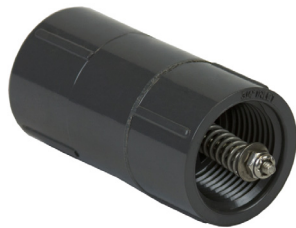
Fipt x Fipt