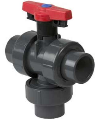
Vertical 3-Way Valve