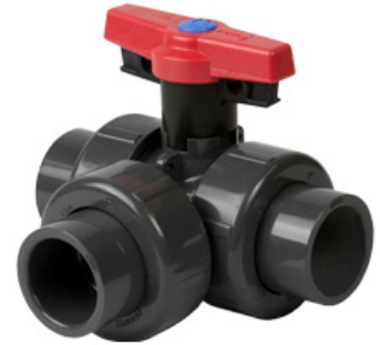
Horizontal Diverter Valve

See Ball Valve Accessories & Repair Kits Section for Additional Options and Features