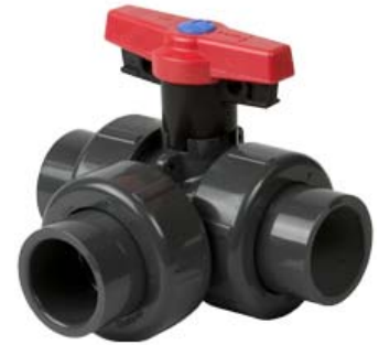
Horizontal Diverter Valve

See Ball Valve Accessories & Repair Kits Section for Additional Options and Features