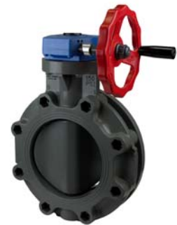
Gear Operator Style

Pressure Rating @ 73°F (23°C), Water 1-1/2" - 12" 150 psi