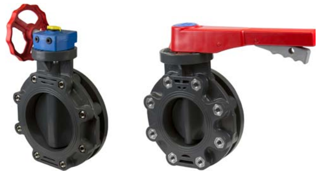
Spears® Standard Butterfly Valve with Lug Inserts Factory Assembled

Pressure Rating @ 73°F (23°C), Water 1-1/2" - 12" 150 psi