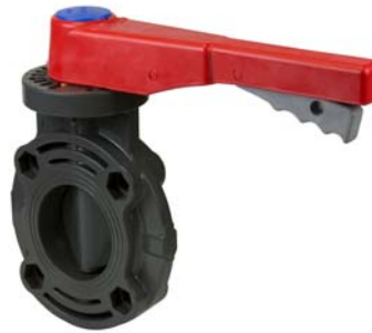
Lever Handle Style