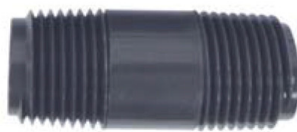
TBE (Threaded Both Ends)