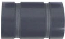
Groove x Groove