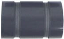
Groove x Groove