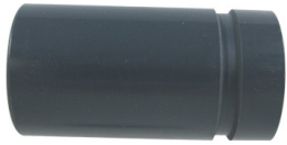
Plain x Groove

PVC/CPVC/PE Nipples furnished may be produced from extruded stock, or from molding grade PVC/CPVC compounds. Both processes provide quality products meeting ASTM requirements. Spears® thermoplastic nipples are produced in a variety of styles, several of which are illustrated below. These are referred to as Plain (no threads), TOE (Threaded One End), TBE (Threaded Both Ends), Grooved (which can be Plain x Groove, Groove x Thread, & Groove x Groove). Special varieties of Polyethylene Nipples include Cut-off, Four-In-One Cut-off and Four-In-One Cut-off Reducing.