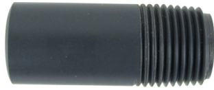
TOE (Threaded One End)