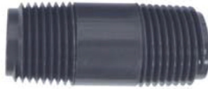
TBE (Threaded Both Ends)