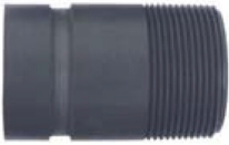
Groove x Thread