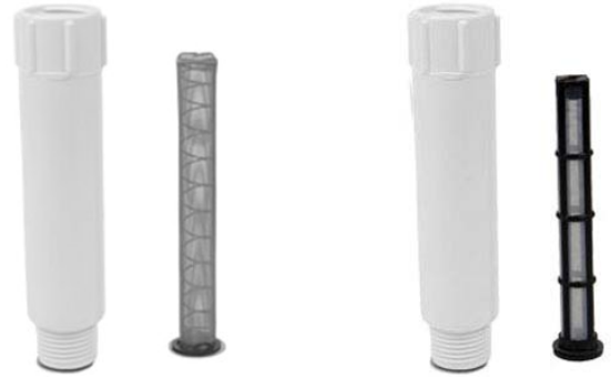
7 GPM Steel