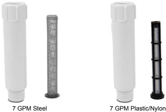
7 GPM Steel