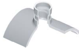
Stub Saddle - Glue On, Socket